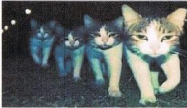
Coming OUT of the Prayer Room